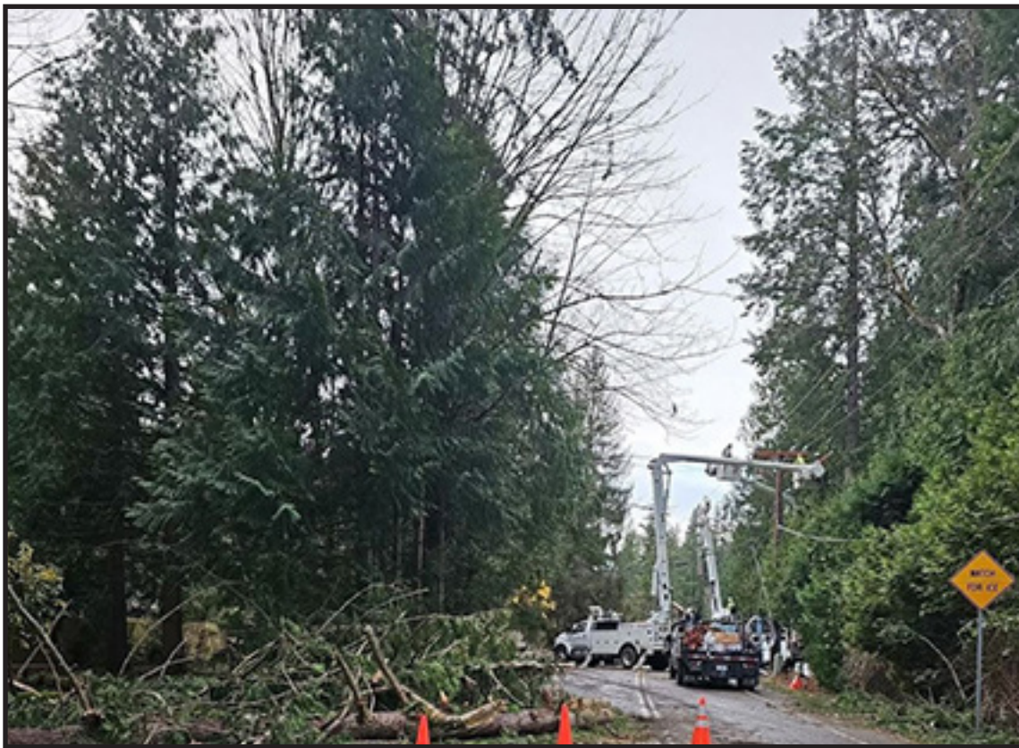
Thank you to all our readers who sent in these photos and lots more. These photos are of Maple Valley, Covington, Ravensdale, Black Diamond and Issaquah. We are hoping everyone's power is now restored. (Continued from page 1)