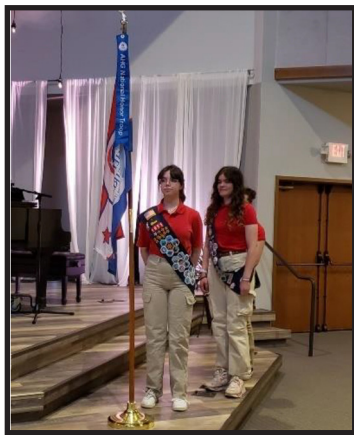
Troop 1911 Flag Ceremony

Past events have included visiting retirement centers, fundraising for and laying wreaths at soldiers gravestones