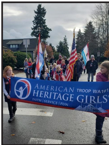
AHG Troop WA 1911 at Veteran's Day Parade, 2023

in partnership with Wreaths Across America, volunteering with Operation Christmas Child, and walking in the Veteran's Day Parade in Auburn, WA.