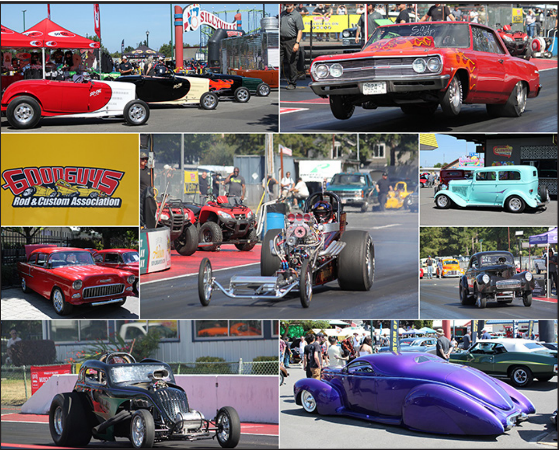
This past weekend of July 25-27 brought the GoodGuys 37 th Griot's Garage Pacific NW Nationals to Pacific Raceways on Friday night for drag racing of these nostalgia machines while at the Washington State Fair Events Center over 2500 beautiful restored custom cars and trucks were on display for all to enjoy. The proud owners of these cars came from all around the country and Canada for three days of competition and remembering the past when these vehicles cruised the road.