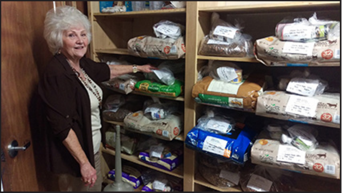
in partnership with the Seattle Humane Society, The Maple Valley Community Center offers a free Pet Food Program for qualifying low-income seniors. Dry pet food will be provided each month for up to three spayed/neutered cats or dogs per household. Canned food will be provided when available and if requested. Special dietary needs will be met if food is available. Complete and submit the Pet Food Application Forms to For more information call the Community Center at 425-432-1272 if you would like to volunteer to help with this program.