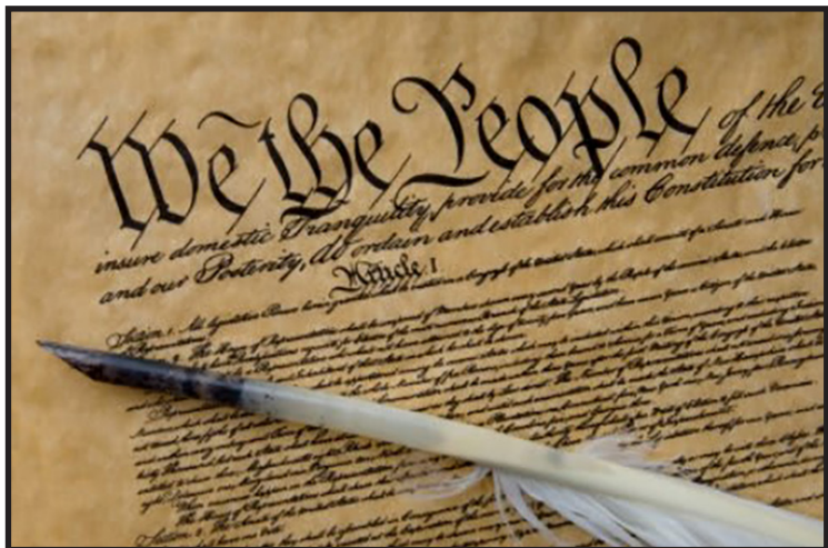
Preamble to the American Constitution, 1787

celebrate to promote awareness and understanding of the U.S. constitution. On Sept. 17, 2025, DAR representatives stood near the large bell located next to Black Diamond Museum. They joined other United States communities in celebrating Bells Across America. Next year, on July 4th, 2026, America reaches 250 years of independence. ~ Submitted by D'Ann Tedford.